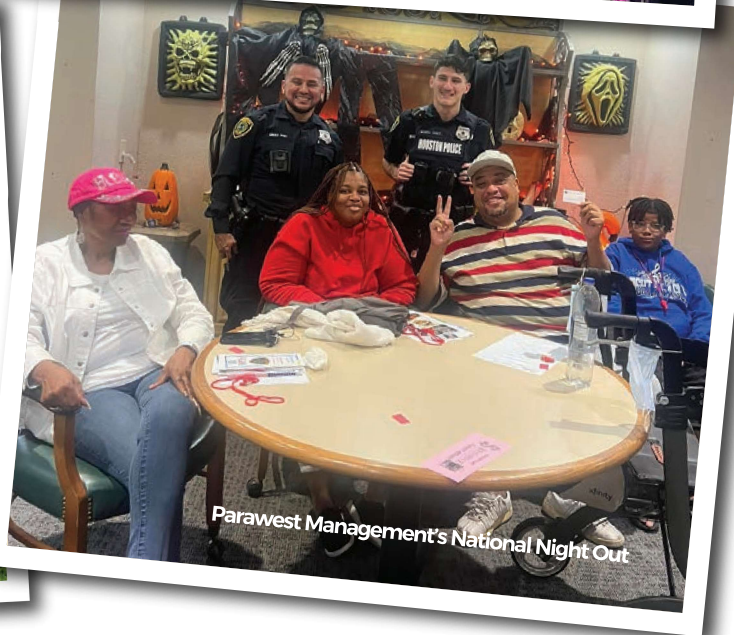
Parawest Management's National Night Out