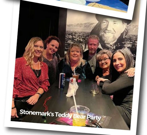
Stonemark's Teddy Bear Party