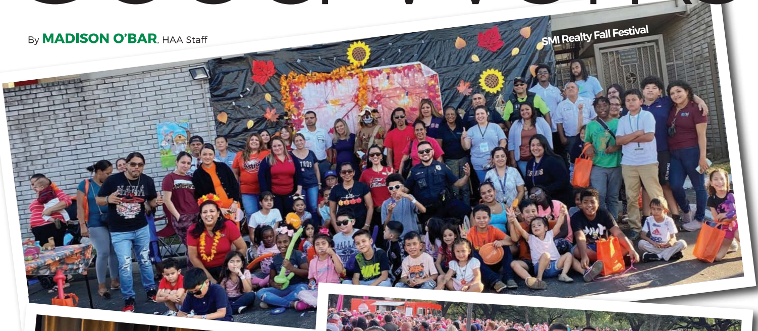
SMI Realty Fall Festival