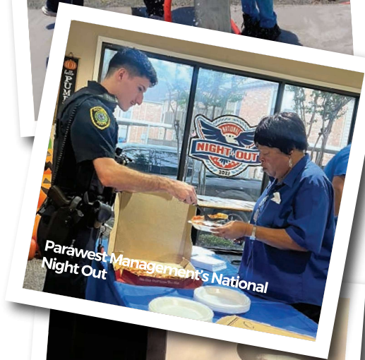
Parawest Management's National Night Out

Parawest Management also hosts an Annual National Night Out event in October. National Night Out is an annual community-building event. The event's primary purpose is to promote positive relationships between law enforcement agencies and the communities they serve, as well as to enhance neighborhood camaraderie and public safety.