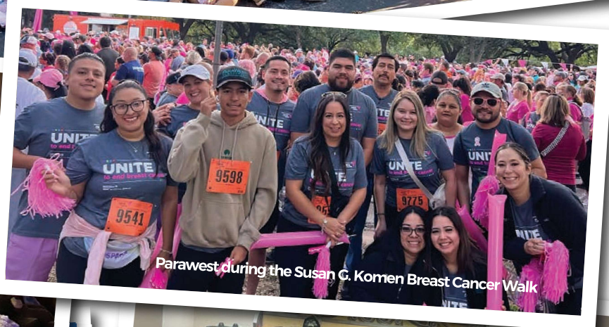
Parawest during the Susan G. Komen Breast Cancer Walk