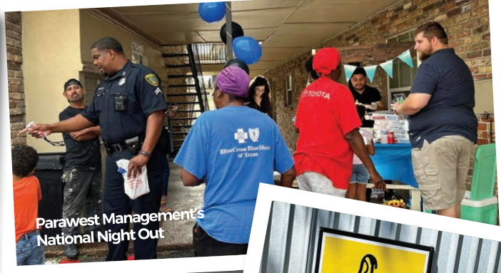
Parawest Management's National Night Out