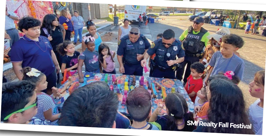
SM Realty Fall Festival