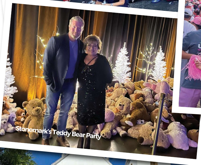
Stonemark's Teddy Bear Party